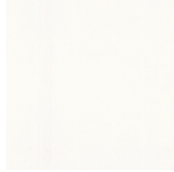
Matte White Lacquer - MWL